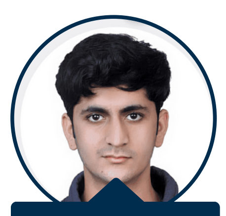
ESHAAN Pathways World School Aravali IBDP SCORE - 42/45